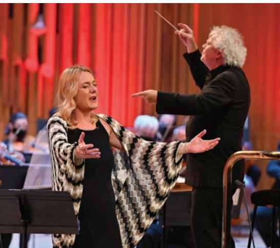
Magdalena Kožená and Sir Simon Rattle